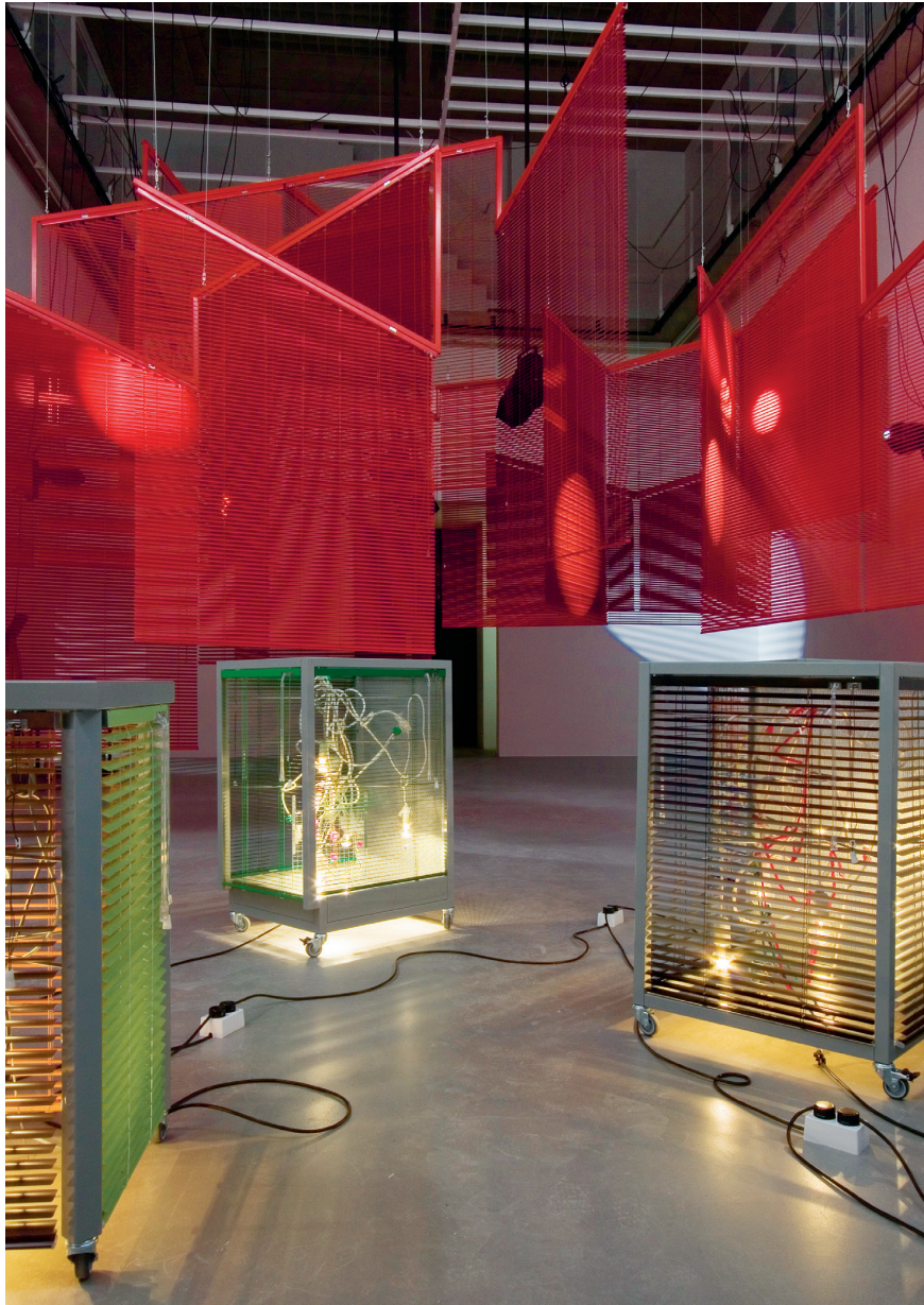
Installation view, 'Siblings and Twins', Portikus, Frankfurt am Main, Germany, 2008. Pictured in the background: Haegue Yang, Red Broken Mountainous Labyrinth , 2008, installation with aluminium venetian blinds and hanging structure, powder-coating, steel wire, moving spotlight and floodlight, dimensions variable; in the foreground: Haegue Yang, 5, Rue Saint-Benoît , 2008, installation comprising eight sculptures made of household appliances, aluminium venetian blinds and frame, powder-coating, perforated metal plates, casters, light bulbs, cable cord, dance-floor objects, metal eyelets, paint grid, metal chain, knitting yarn and paper, dimensions variable.

2009 and 2012. 21 In keeping with Duras's note, Yang replaces acting with reading, but takes it one step further by having the entire text read by a single voice – the voice of Jeanne Balibar at dOCUMENTA (13) in Kassel in 2012. In this staging, Balibar's lone voice was only accompanied by a screen that functioned as a backdrop to her performance, and showed a sequence of close-ups of a young woman lying on a bed and then, upon her disappearance,